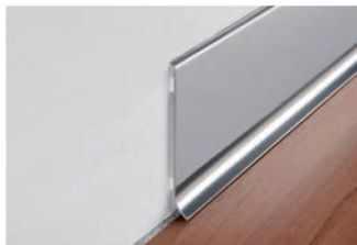
POLISHED STAINLESS STEEL AISI 304/1.4301-V2A with protective film bar length 2 LM - pack. 20 Pcs - 40 LM