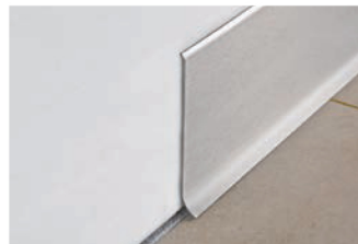
SATINED STAINLESS STEEL AISI 304/1.4301-V2A with protective film bar length 2 LM - pack. 20 Pcs - 40 LM