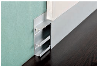
EXAMPLE AND INSTRUCTIONS FOR LAYING METHODS

PROSKIRTING FLAT is the new innovative skirting designed with an integrated system for plasterboard walls, and devised to create a skirting flush to the wall for a modern and contemporary touch.